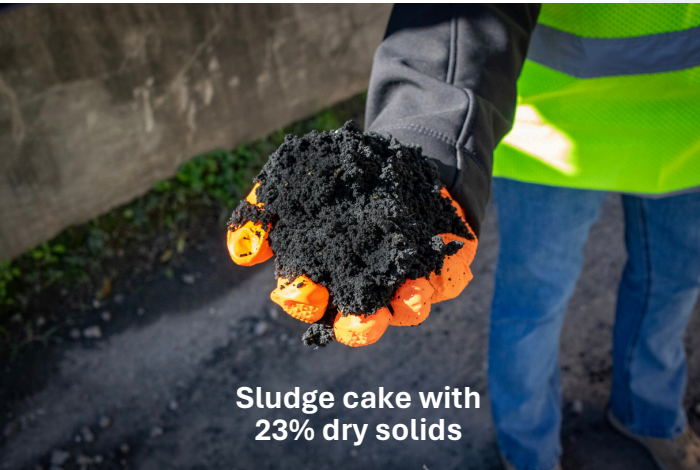
Sludge cake with 23% dry solids